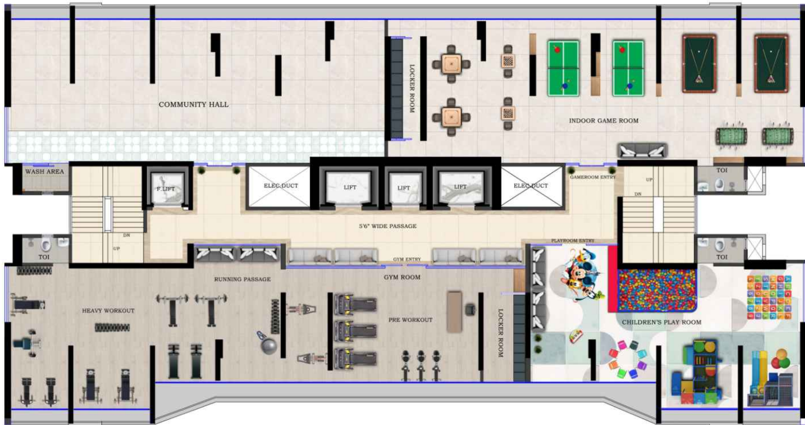
RECREATIONAL FLOOR PLAN AT 34 TH LEVEL