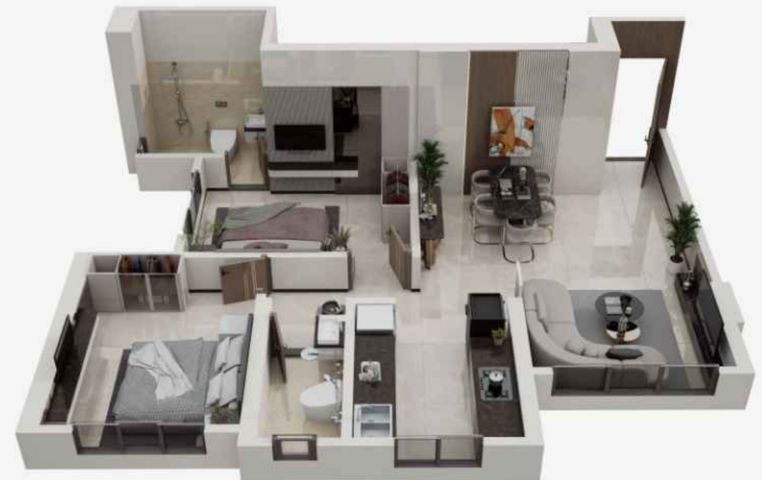
2 BHK ISOMETRIC VIEW

Disclaimer: The information contained in this communication is intended, solely to provide general information for discussion purposes to the prospective buyer and will not constitute or form part of any agreement or form the basis of any contract. This does not constitute to any offer / invitation to offer or sale. No warranty, neither representation nor covenant is given or implied as to the accuracy of the whole or any part of this information. All renderings, floor plans, pictures, maps, drawings, amenities, facilities etc. are the artists' conceptions and not actual depictions of the building, its walls, roadways or landscaping. Some dimensions in floor layouts have been rounded up to 2 inches. The design, specification and proposed development specified in the brochure are subject to the approval of the respective authorities and would be changed, if necessary. The discretion remains with the developer. This brochure is for guidance and not a legal document. This brochure should also not be reproduced, copied or made available to others in any form of transmission other than intended by the developer.