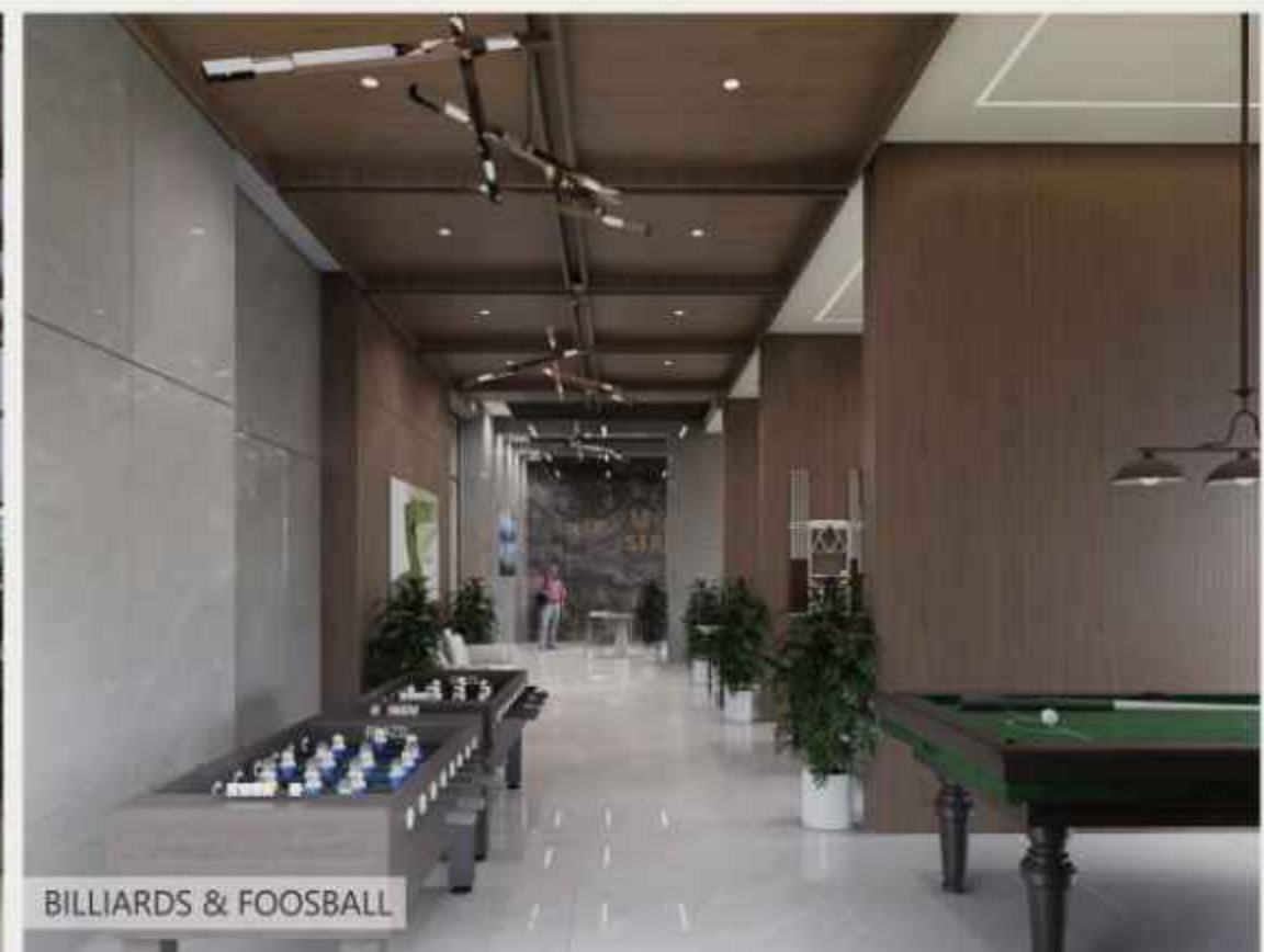
BILLIARDS & FOOSBALL