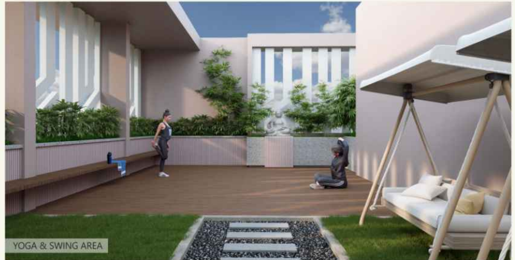
YOGA & SWING AREA