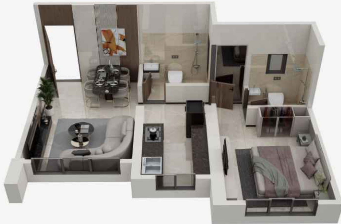
1 BHK ISOMETRIC VIEW