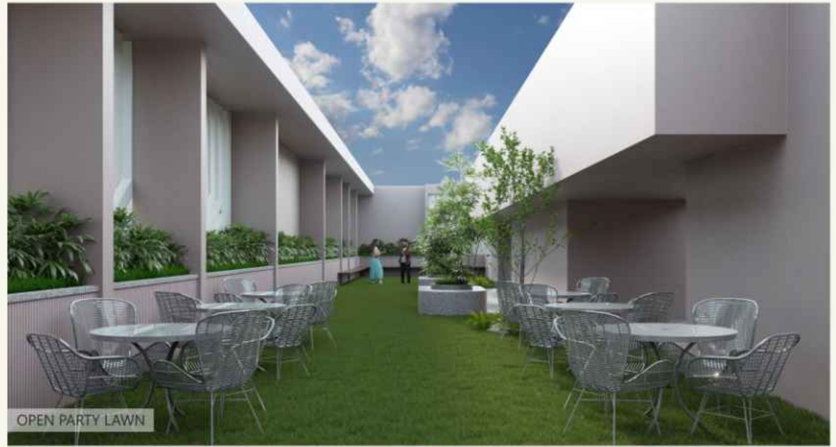
OPEN PARTY LAWN