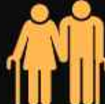
Senior Citizen Sit-Out