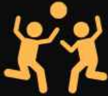
Kids Play Garden

Experience a lifestyle of exceptional amenities for all ages. Enjoy a luxurious Community Centre, a dedicated Kids Play Garden, Badminton & Basketball Courts, a Cricket Pitch and an Outdoor Gym. Relax on the Yoga Lawn, enjoy entertainment at the open-air Amphitheatre or unwind in our serene Aerobic Garden, Senior Citizen Sit-Out, and Outside Library.