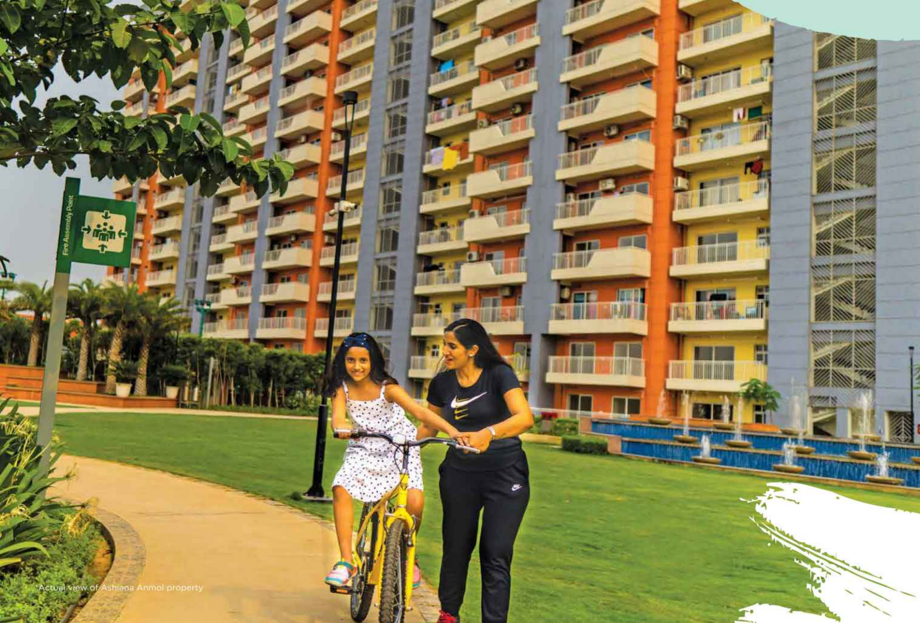
*Actual view of Ashiana Anmol property