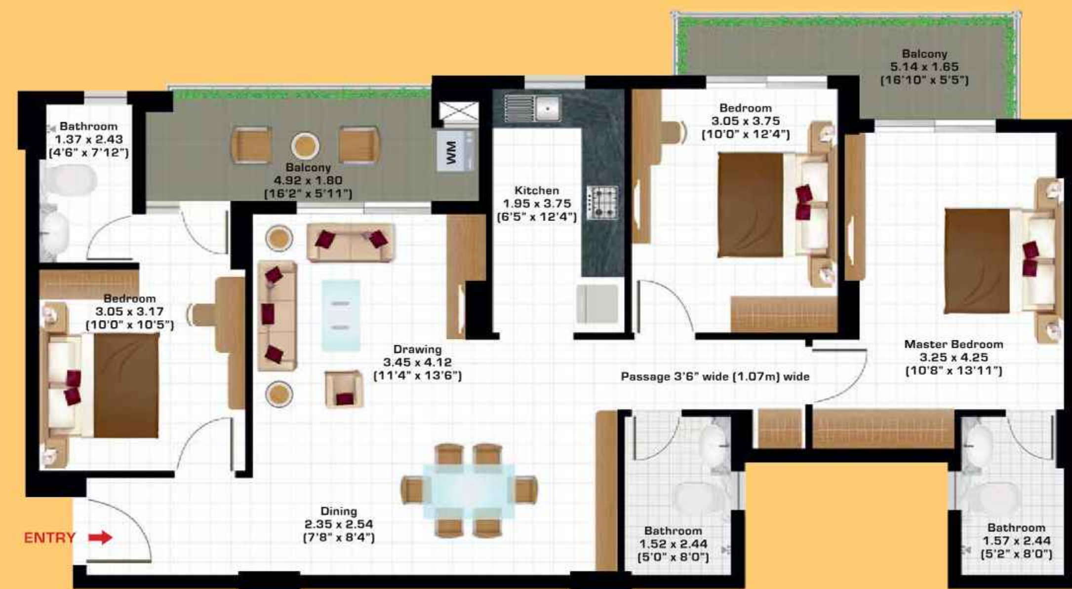
Lavender 2 3BHK + 3 Bathrooms