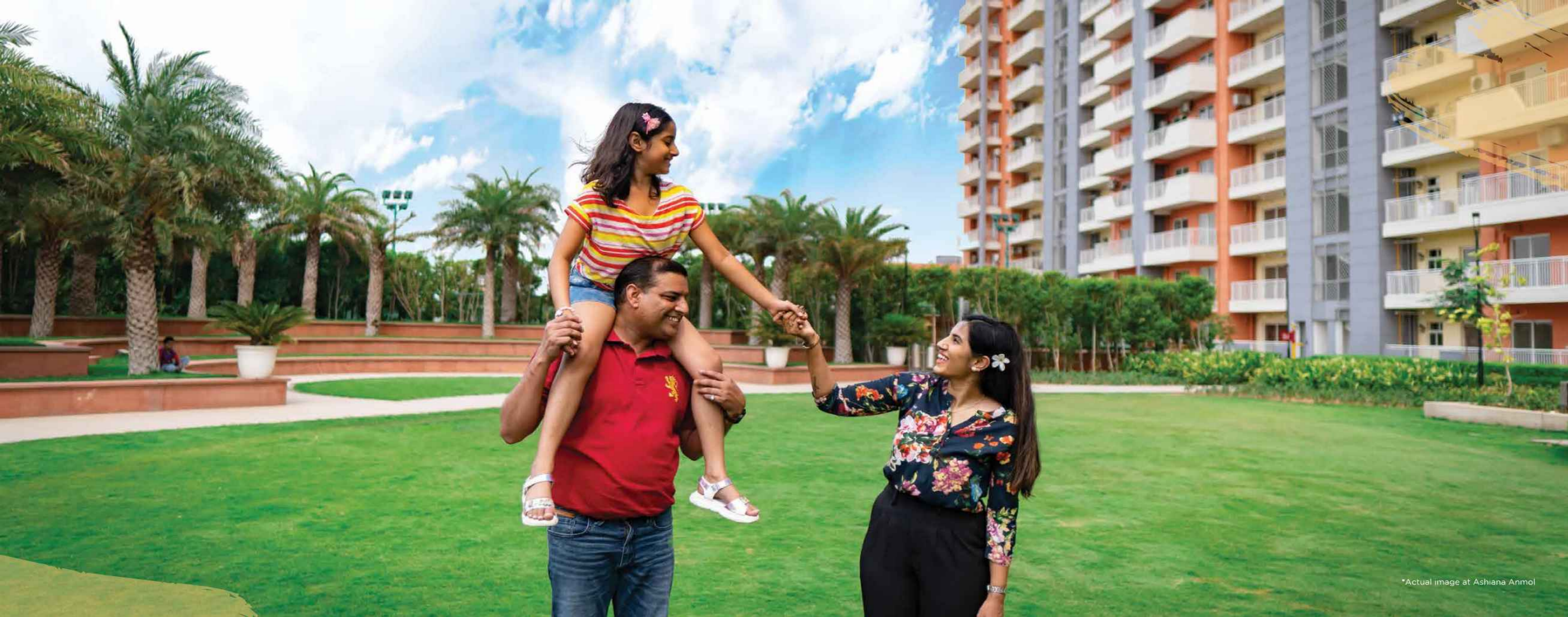
*Actual image at Ashiana Anmol