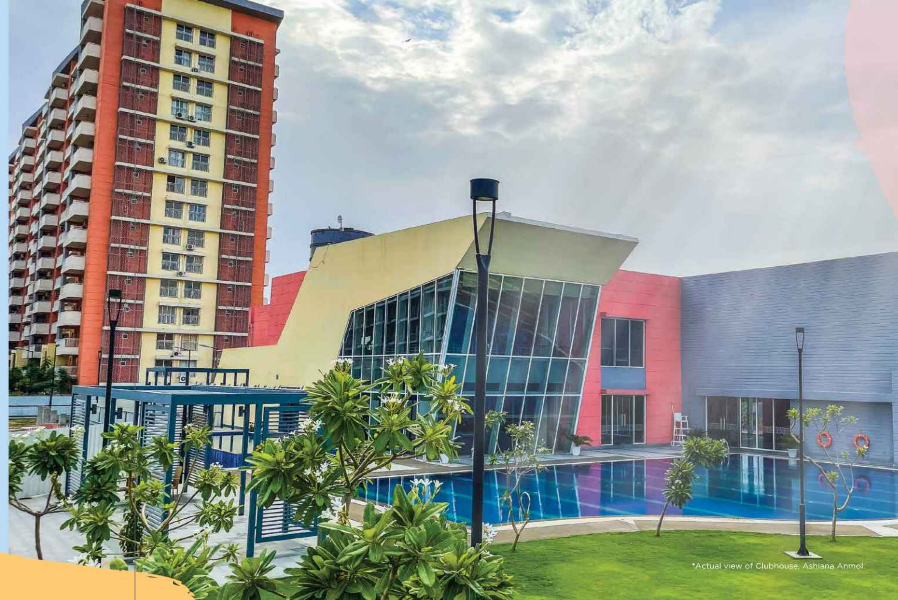
*Actual view of Clubhouse, Ashiana Anmol.

Not only the children, but even you will get your own recreational spaces. The Clubhouse here has all the finest amenities, where you can unwind over a game of billiards or simply hang out with friends and make new ones every day. So that while your children are discovering new passions, so are you.