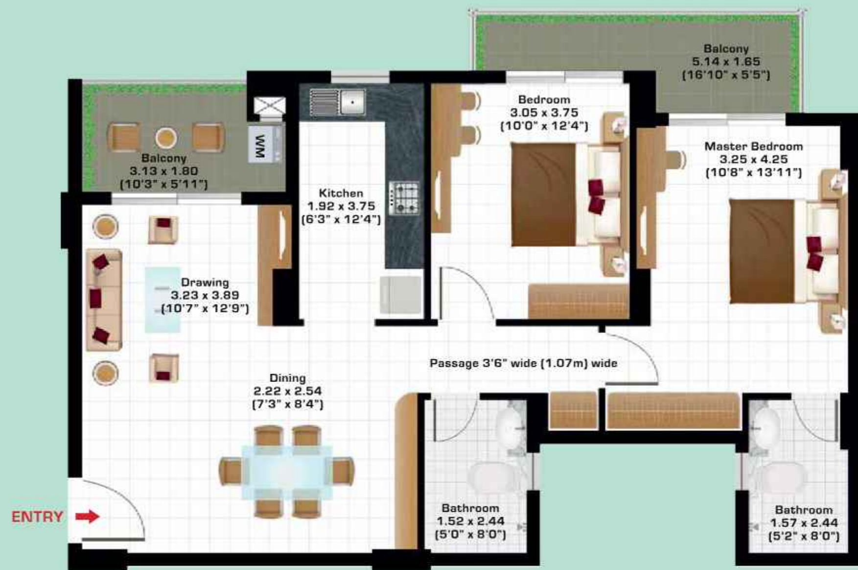
Magnolia 2 2BHK + 2 Bathrooms