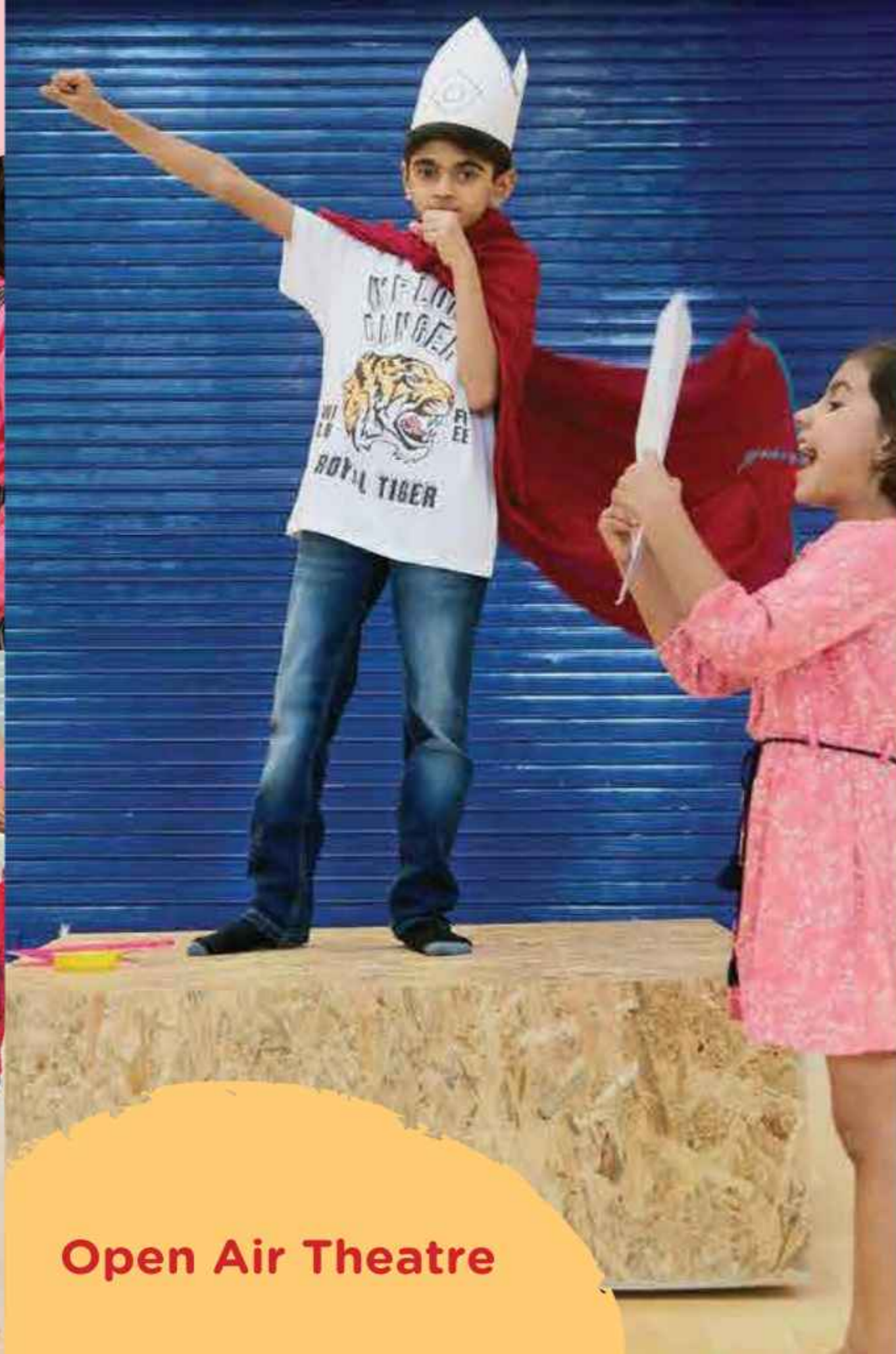
Open Air Theatre