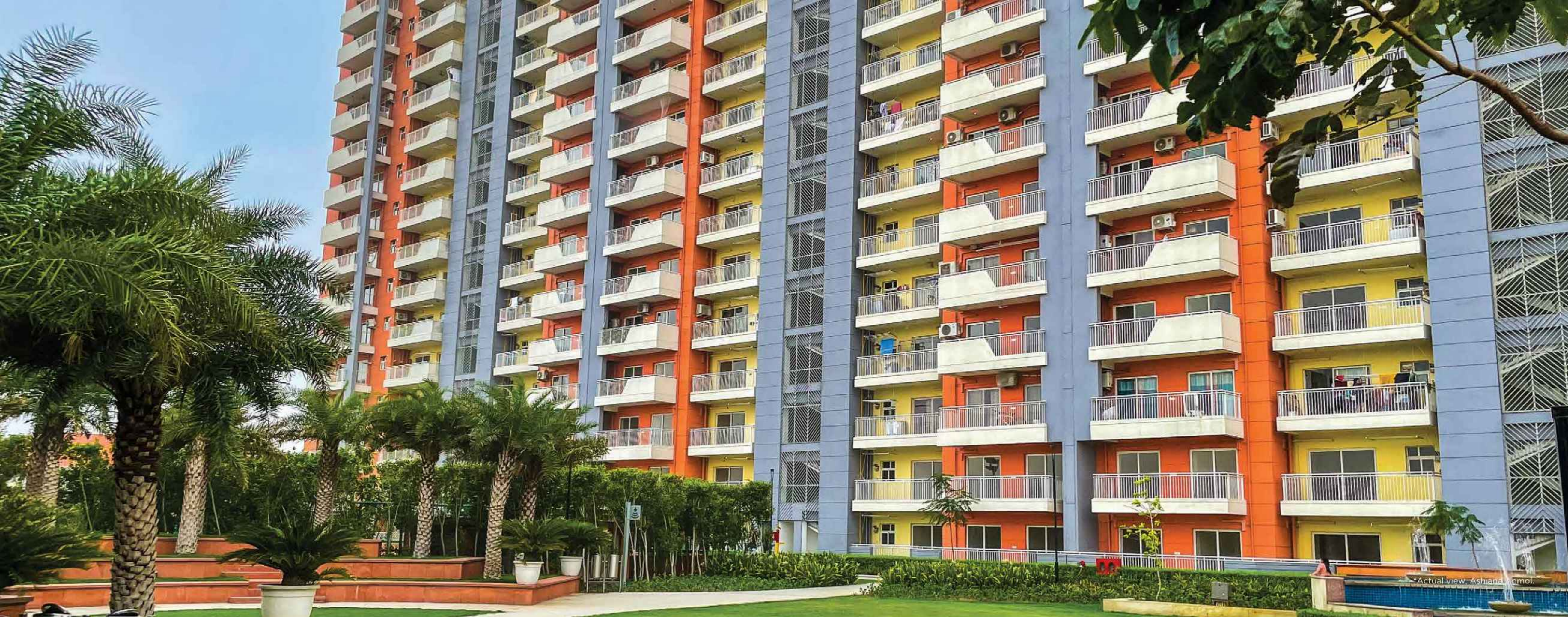
Actual view, Ashiana Anmol.