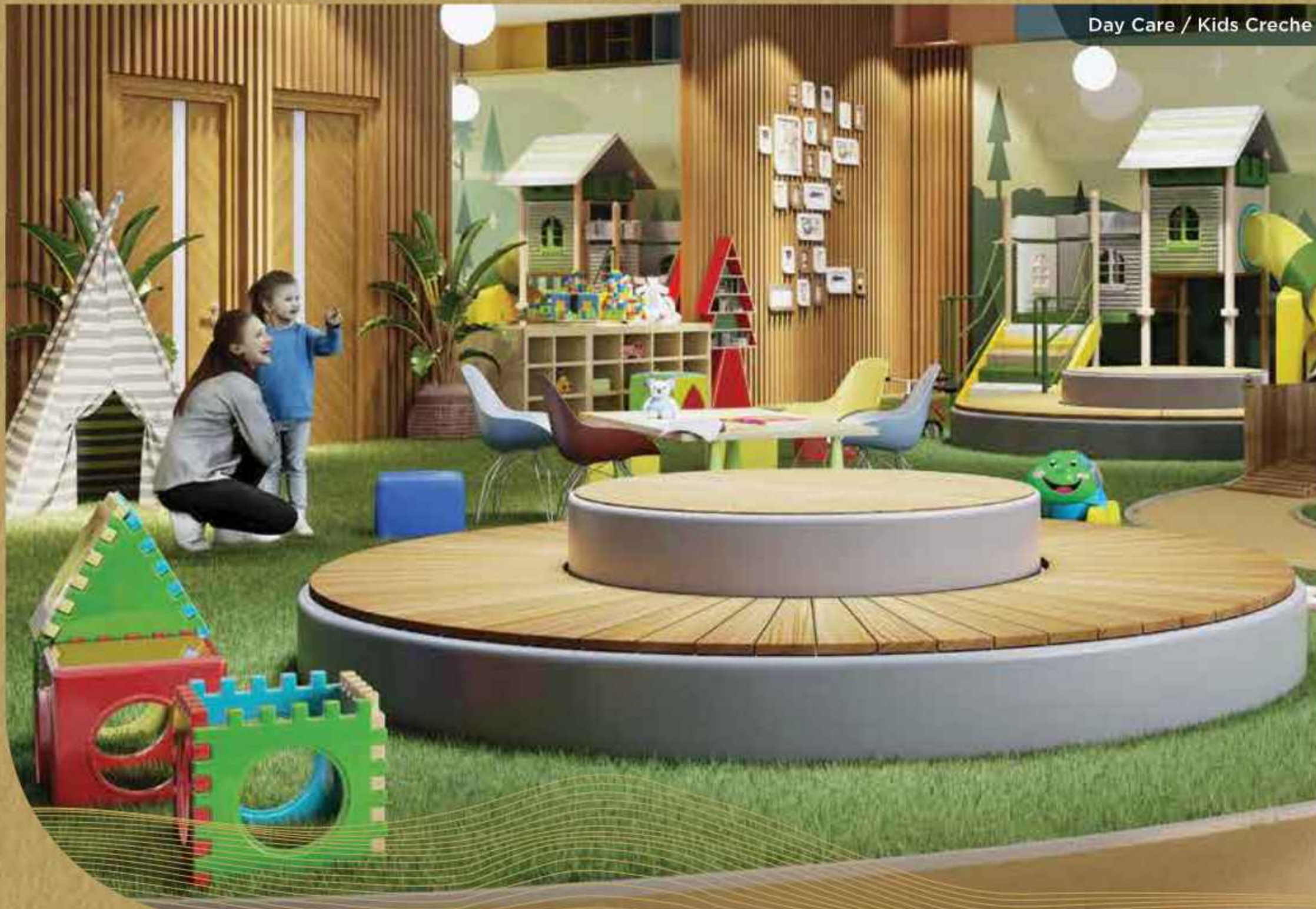
Day Care / Kids Creche