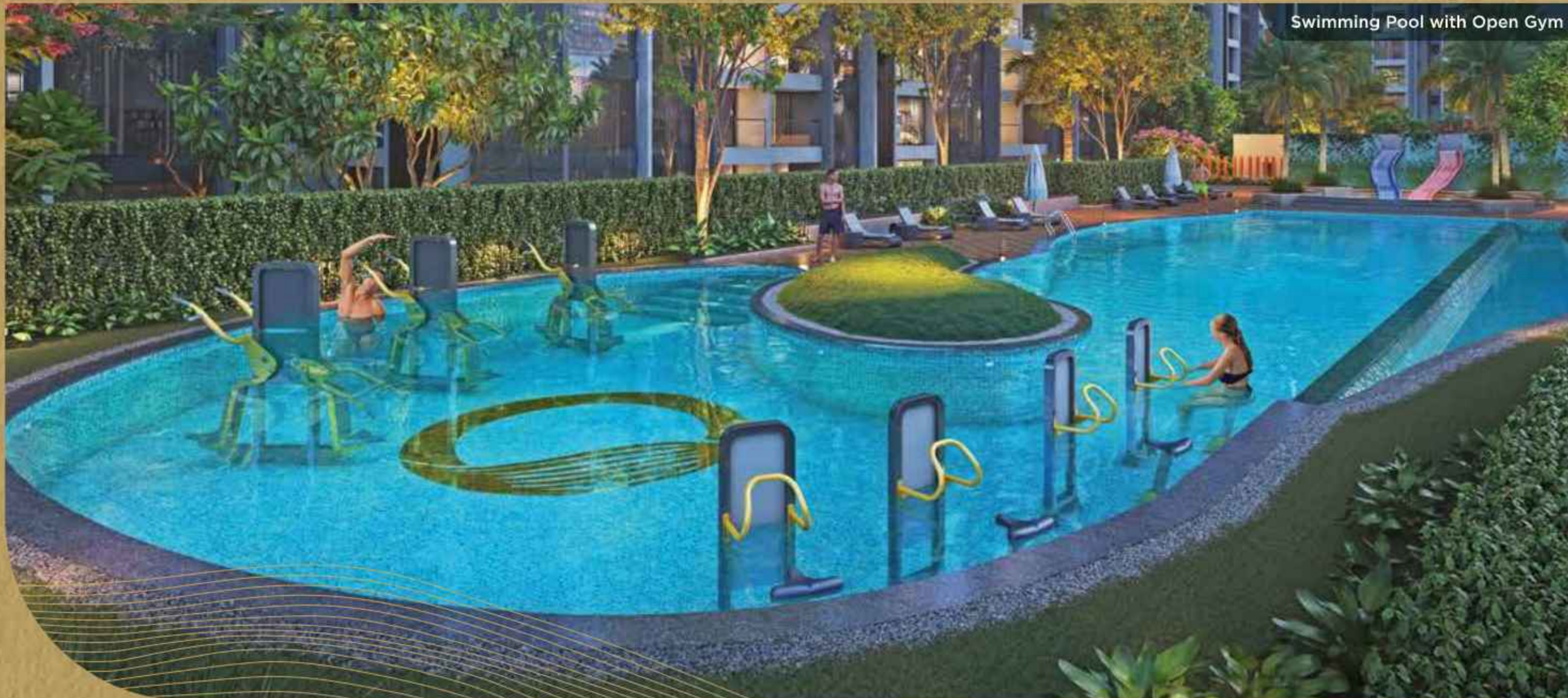
Swimming Pool with Open Gym