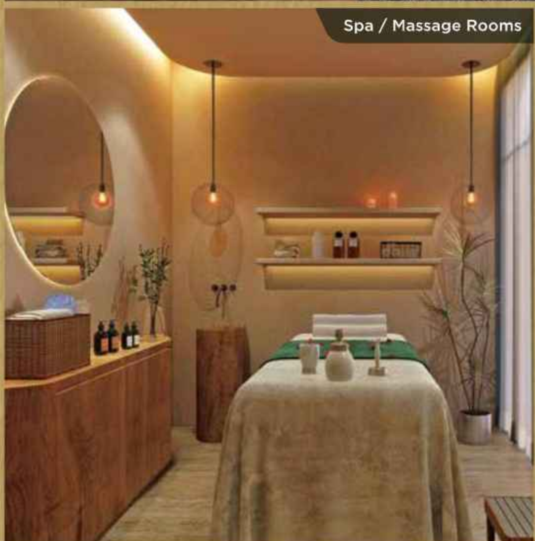
Spa / Massage Rooms