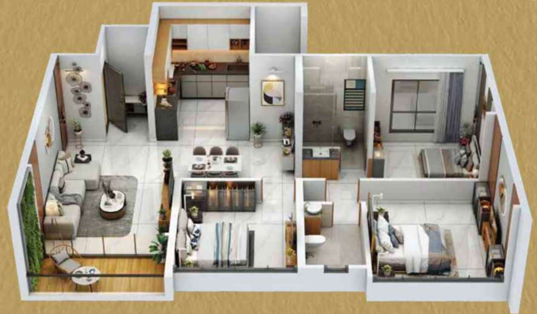
2.5 BHK - Cut Section

Artist's Impression | All Images are representation purpose only