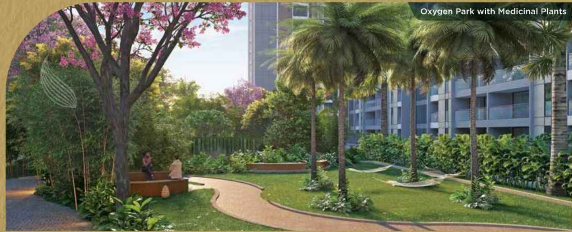
Oxygen Park with Medicinal Plants

Every amenity should support a lifestyle that's green, fit and holistic - at Pristine O2 world, we truly believe this. Starting with an Oxygen Park packed with medicinal plants, each amenity here is a motivational treat.