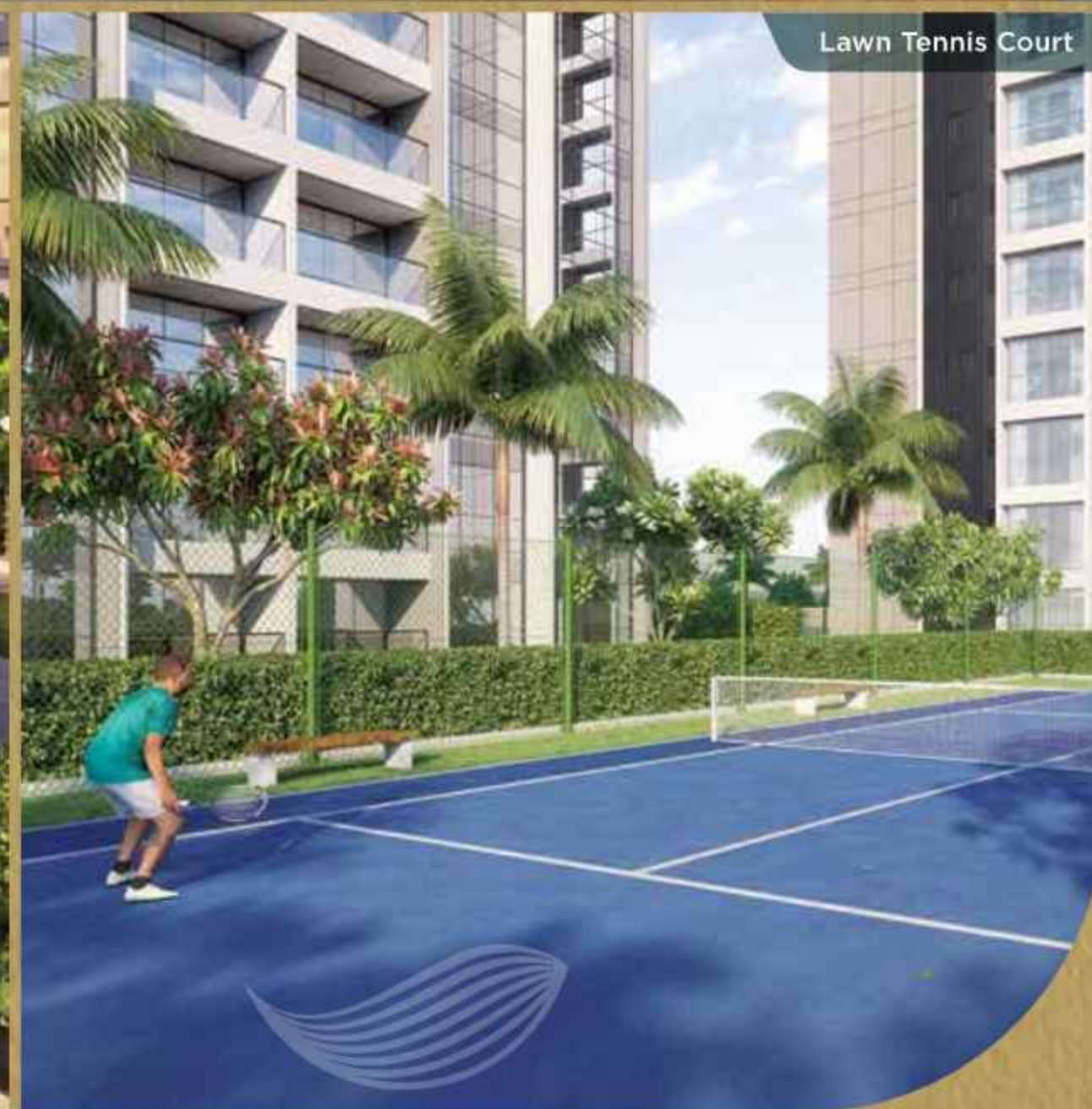
Lawn Tennis Court

Artist's impression. All images are representation purpose only.