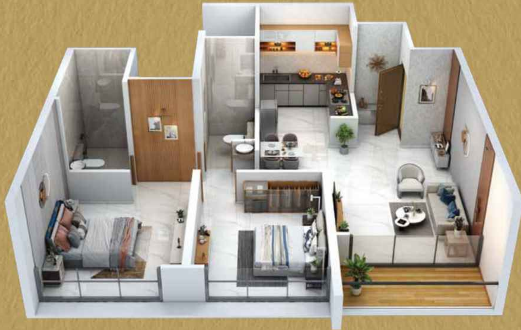
2 BHK - Cut Section

Artist's Impression | All Images are representation purpose only