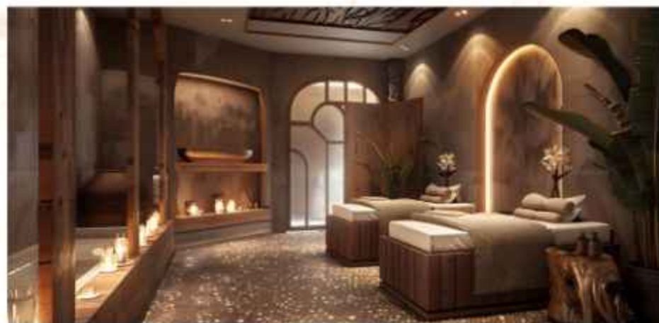
SPA & SAUNA