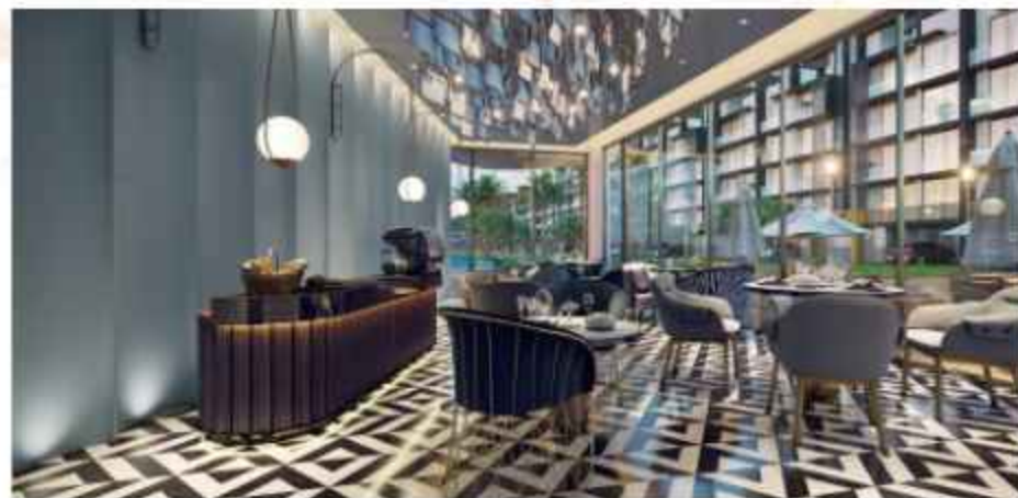
FINE DINE RESTAURANT