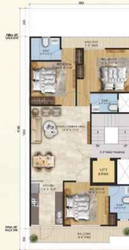
TYPICAL FLOOR PLAN 1st to 4th