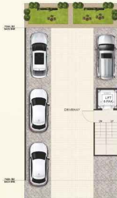
STILT S1 to S4