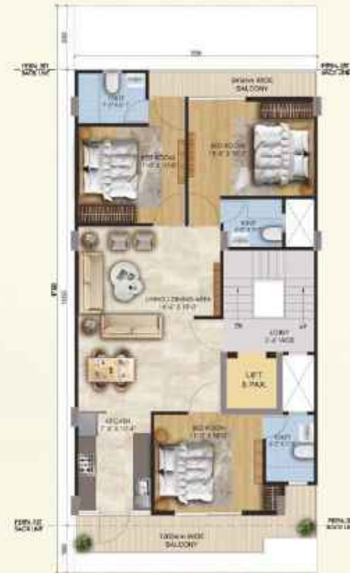
TYPICAL FLOOR PLAN 1st to 4th