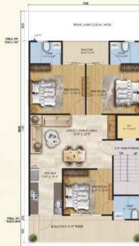
TYPICAL FLOOR PLAN 1st to 4th