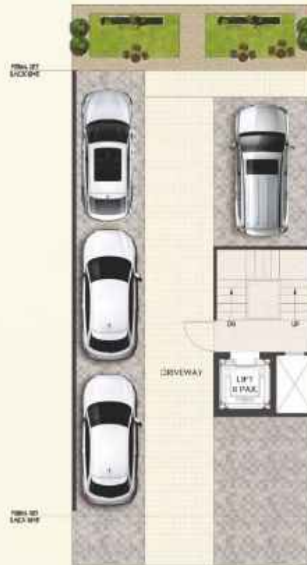
STILT S1 to S4