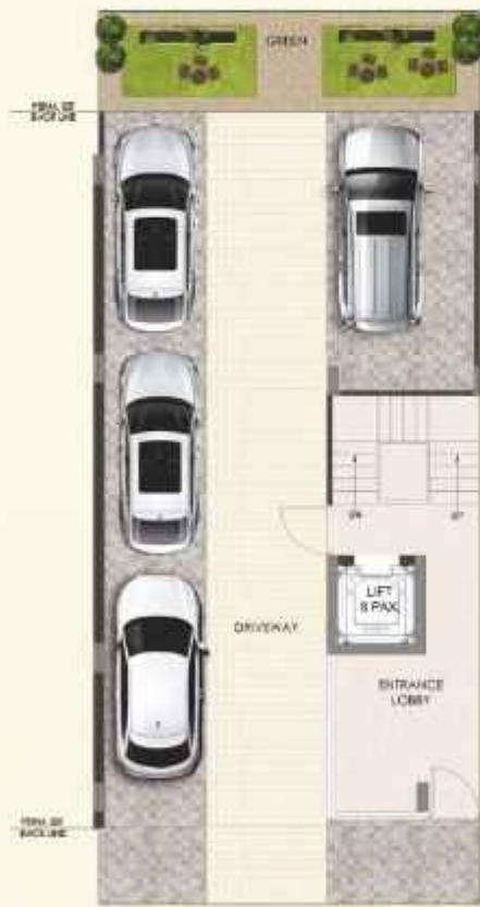
STILT S1 to S4