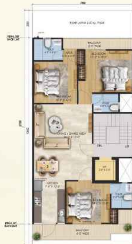
TYPICAL FLOOR PLAN 1st to 4th