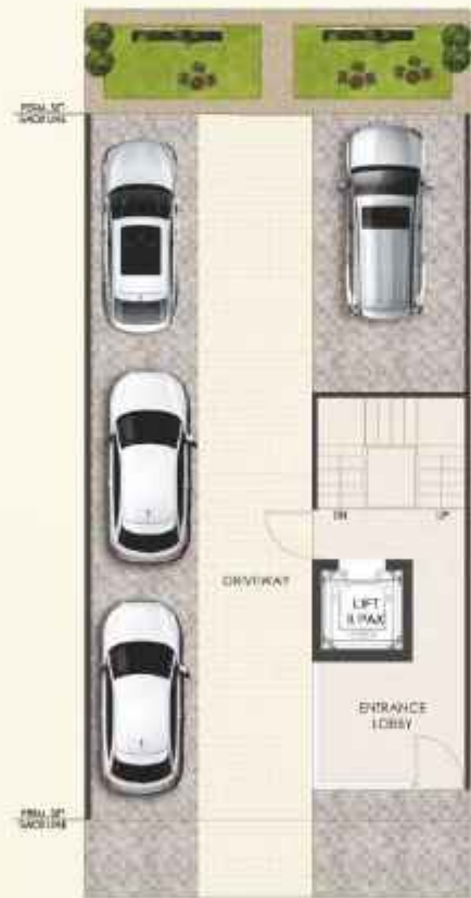
STILT S1 to S4