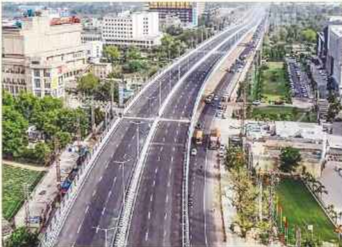
The Sohna elevated road has significantly shortened the distance and made travel to the early sectors of Sohna far smoother and more convenient. It takes only 15 min to reach Avani Floors from Vatika Chowk.

THE EARLY SECTORS OF SOHNA STAND AT THE FOREFRONT OF THIS GROWTH, DRIVEN BY AFFORDABILITY AND HASSLE-FREE CONNECTIVITY.