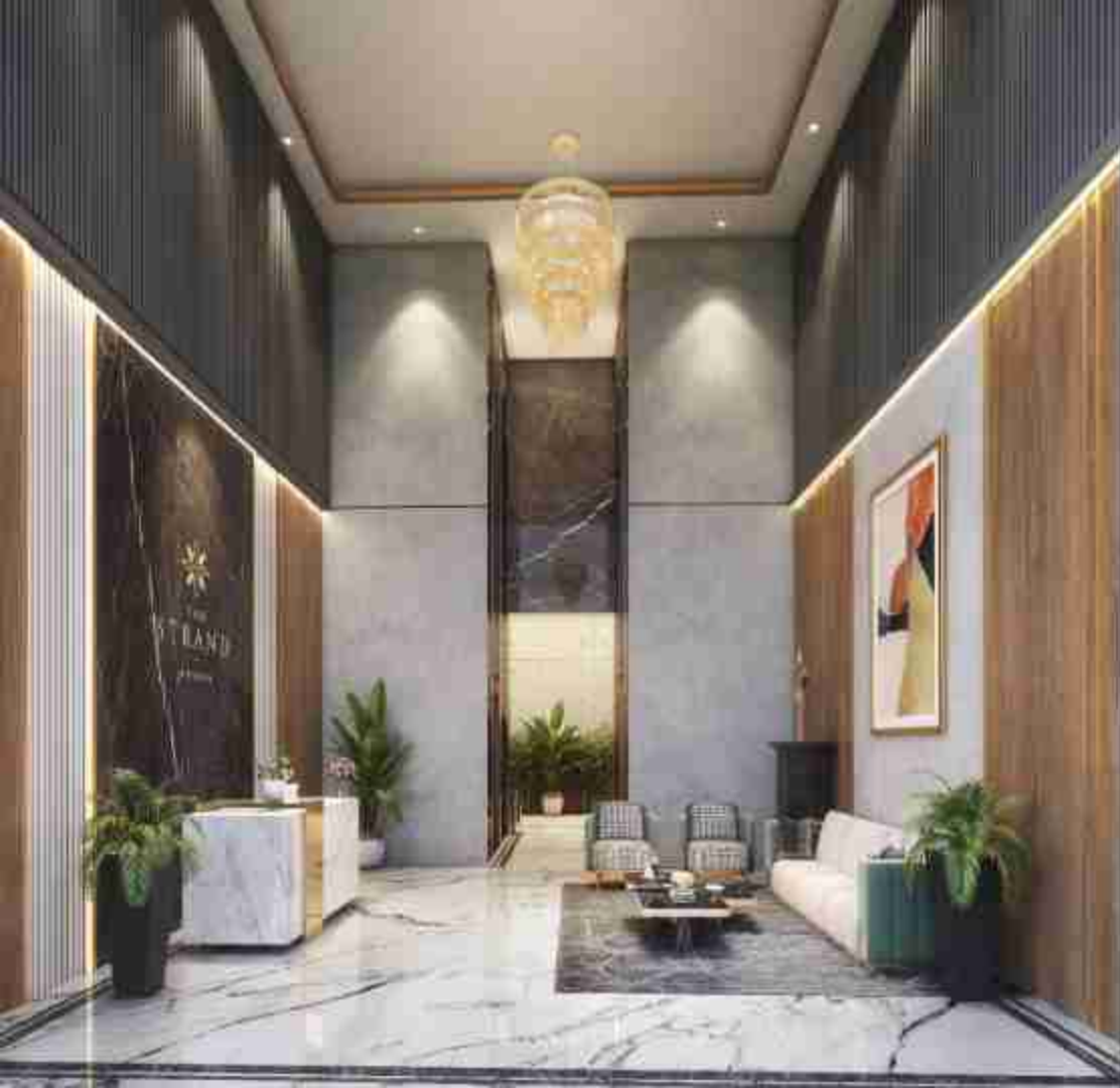
A Grand Double Entrance Lobby