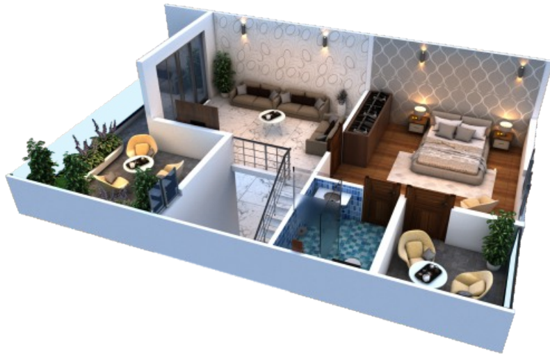
Ground, First & Second Floor Isometric Views