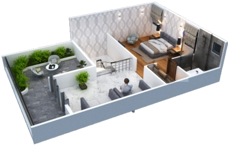
Ground Floor Isometric View