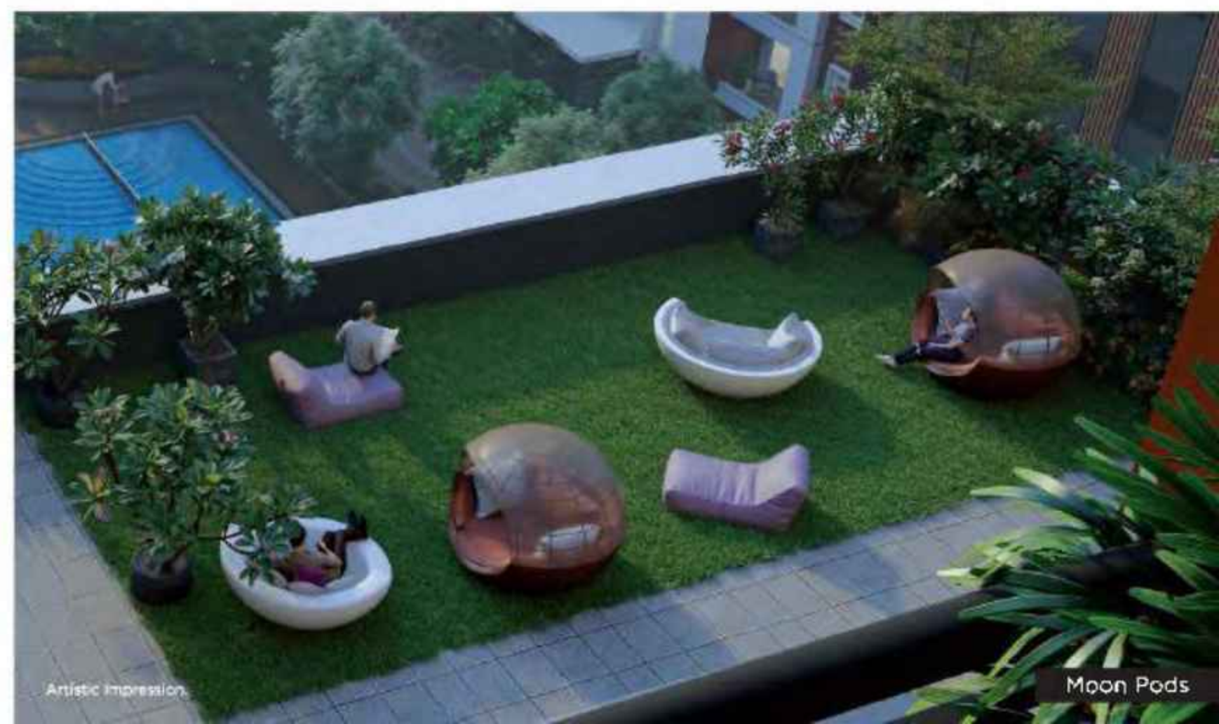
Sky Gazing Deck

Images used are for representation purpose only.