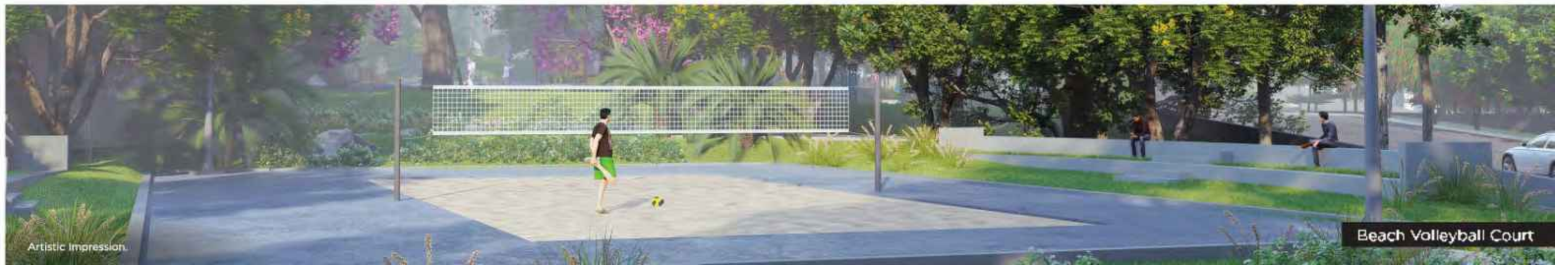
Beach Volleyball Court