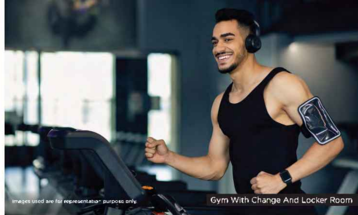
Gym With Change And Locker Room

Images used are for representation purpose only.