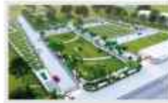
PROJECT KEY MAP