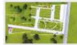
PROJECT TOP VIEW