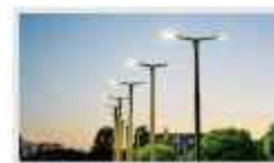
STREET ROAD LIGHTS