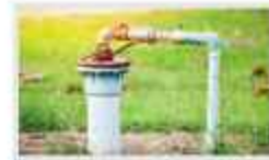
BOREWELL WATER SUPPLY