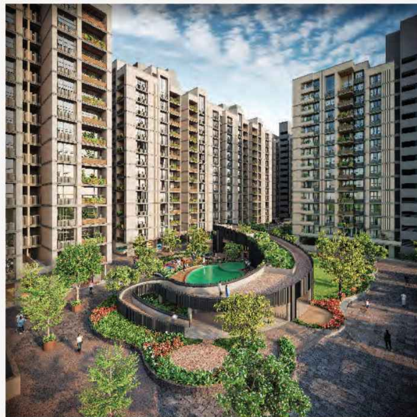
The central gardens continue to be a place of urban enrichment, with people choosing to spend their leisure time relaxing amongst the greenery.