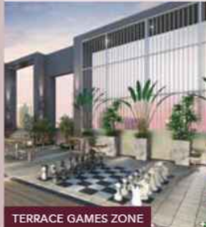
TERRACE GAMES ZONE