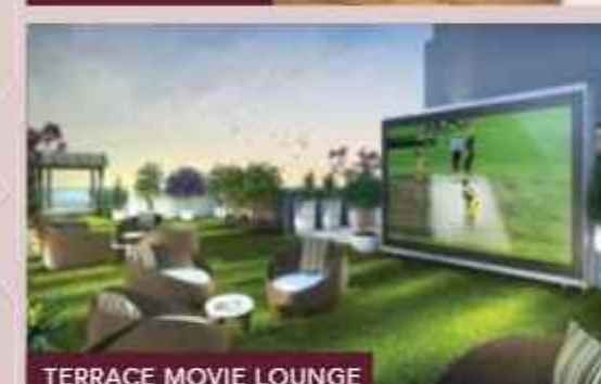
TERRACE MOVIE LOUNGE