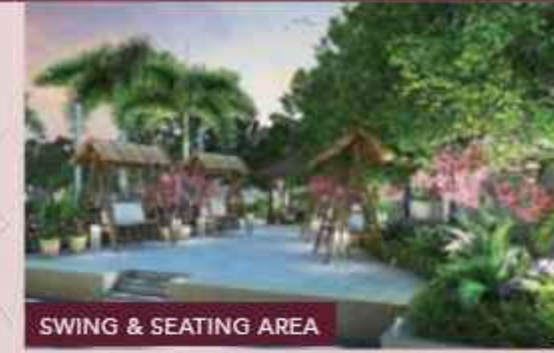
SWING & SEATING AREA