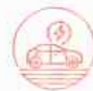
EV CHARGING POINT