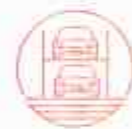
PROVISION FOR STACKED PARKING