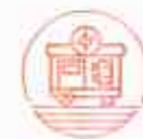
COMMON AREA POWER BACKUP