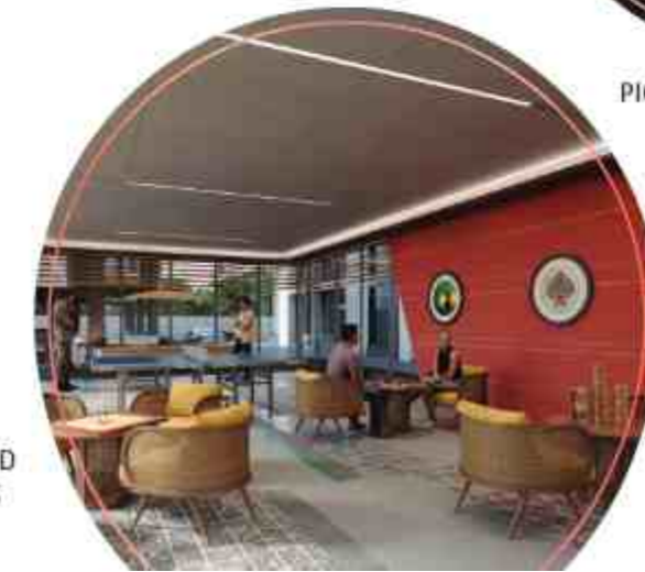
AIR-CONDITIONED INDOOR GAMES