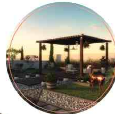
PICNIC SPOT ON TERRACE