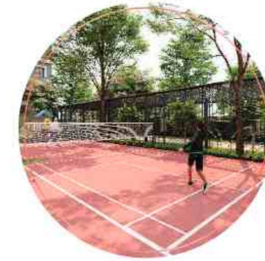
BADMINTON / VOLLEY BALL COURT