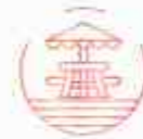
PICNIC SPOT ON TERRACE