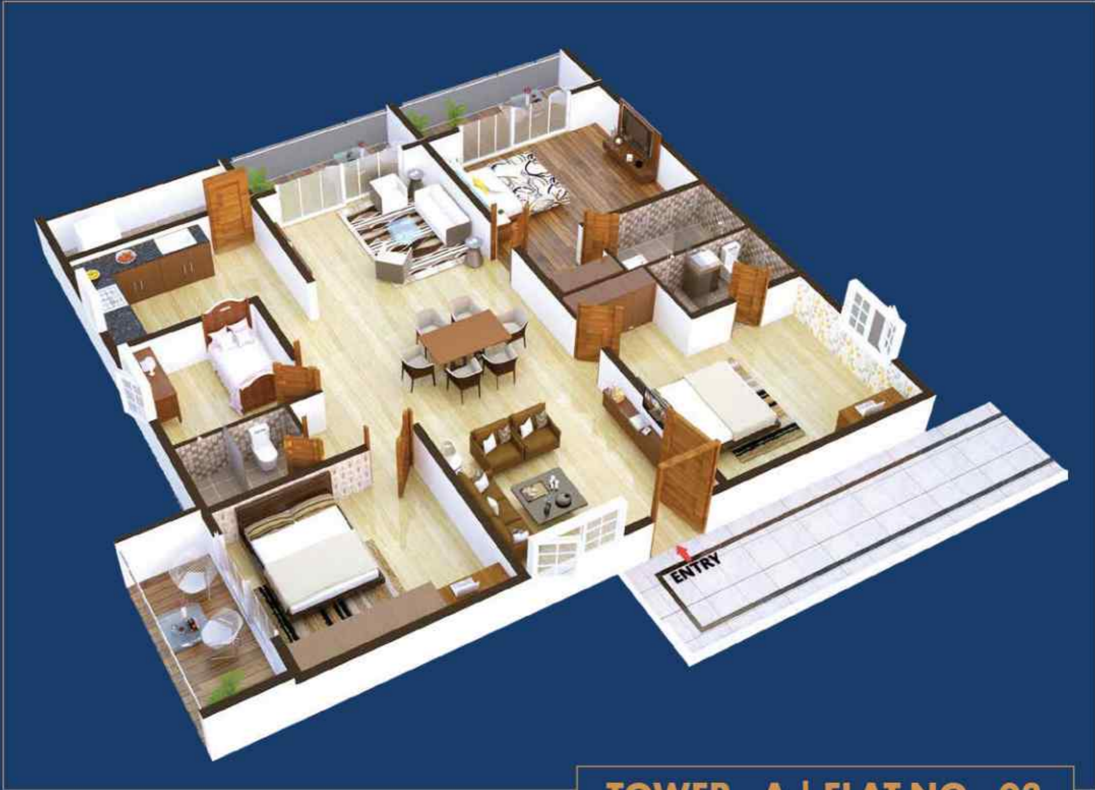
TOWER - A | FLAT NO - 03