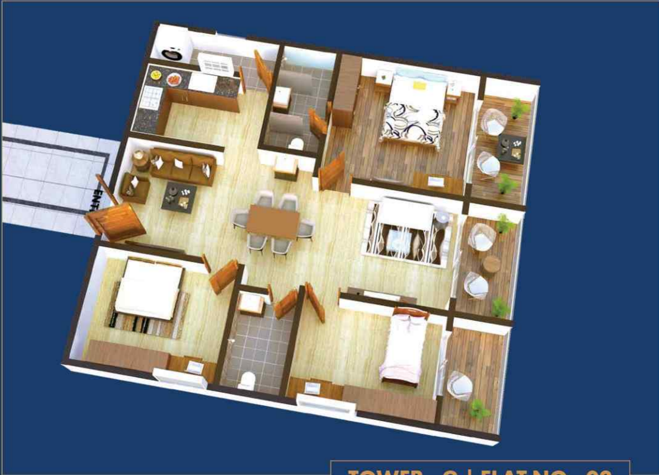
TOWER - G | FLAT NO - 02