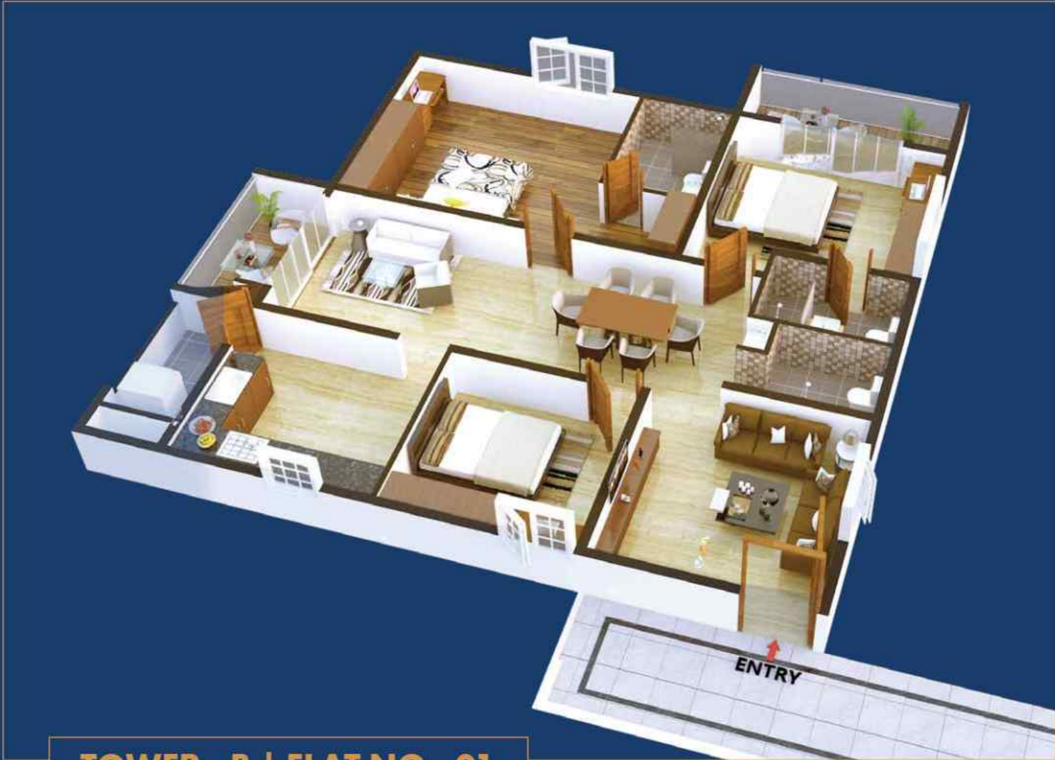
TOWER - B | FLAT NO - 01