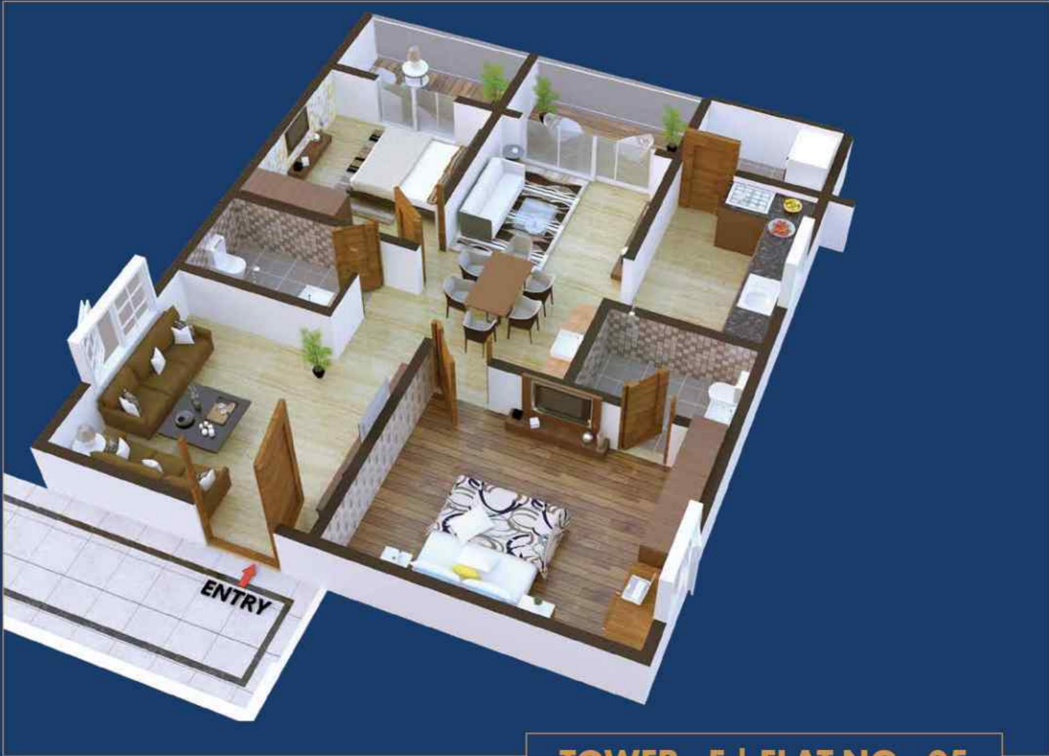
TOWER - F | FLAT NO - 05