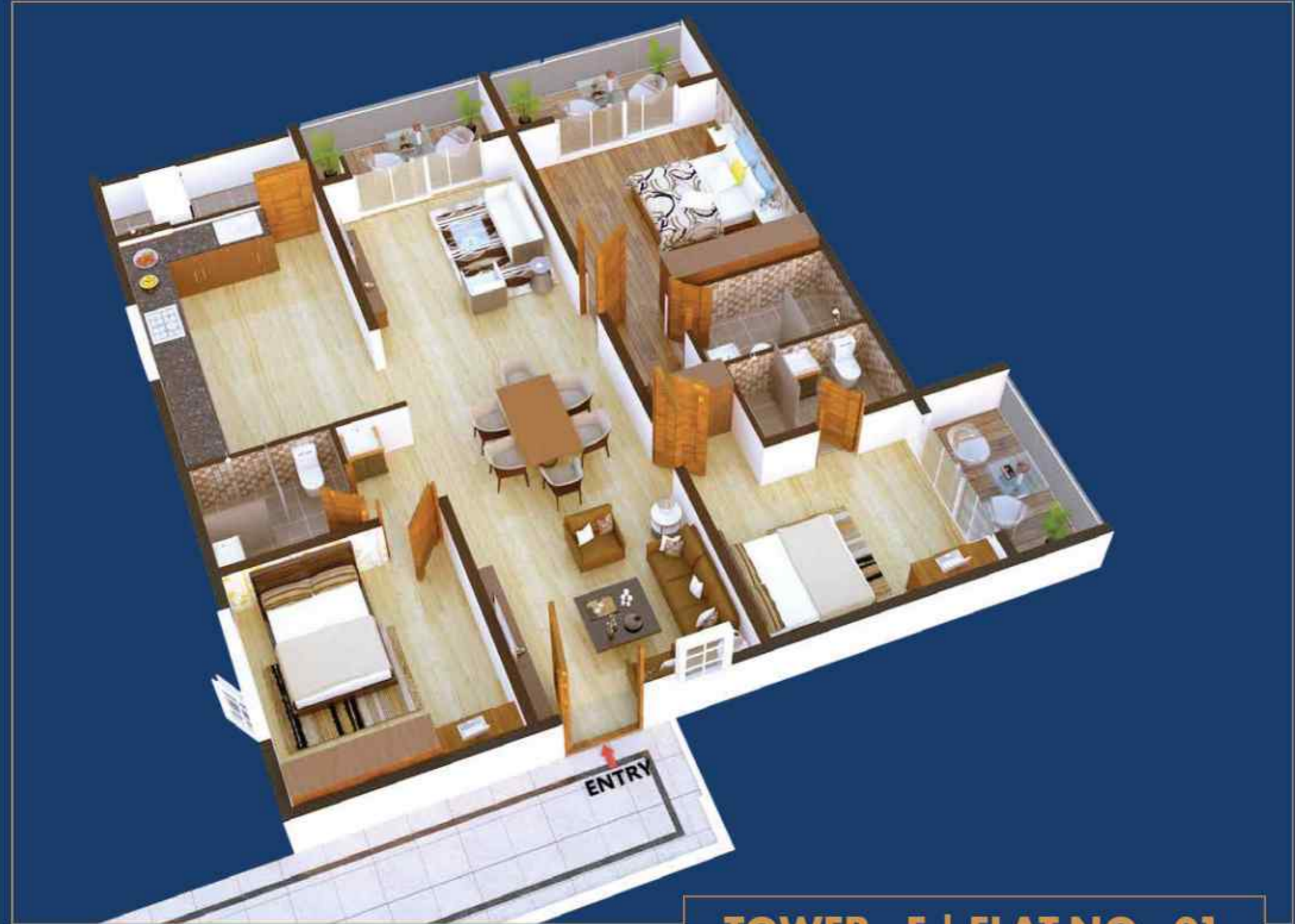
TOWER - E | FLAT NO - 01