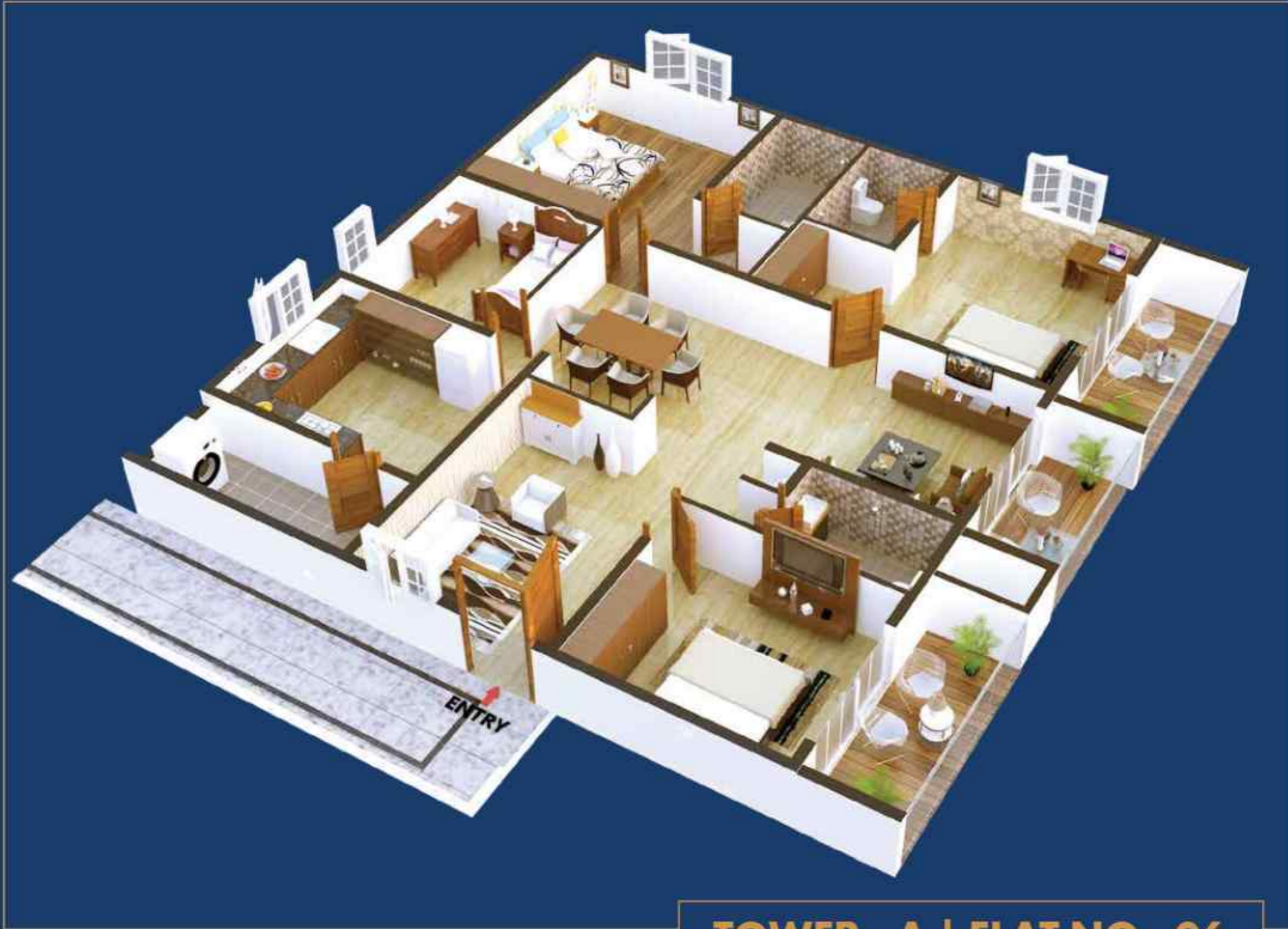
TOWER - A | FLAT NO - 06