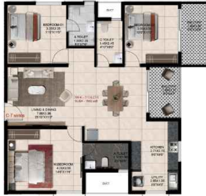
SBA: 1580 sft

When it comes to space, Trendsquares Akino is an impressive masterpiece worthy of your distinctive taste. Indulge in interiors with an efficient layout that offer unmatched luxury & modern comfort.