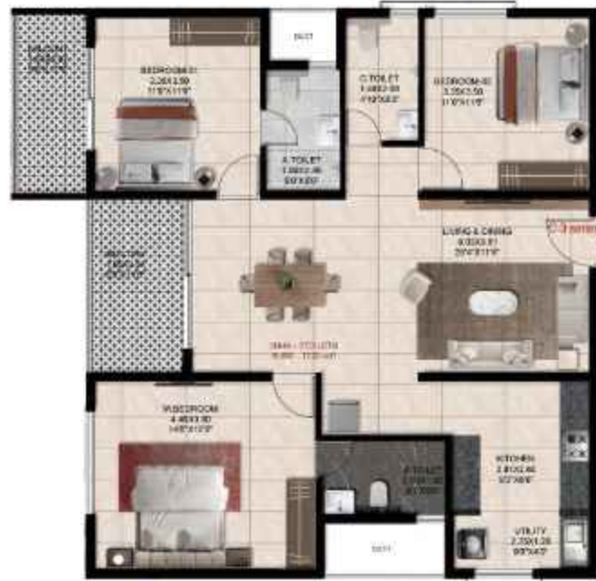
SBA: 1720 sft