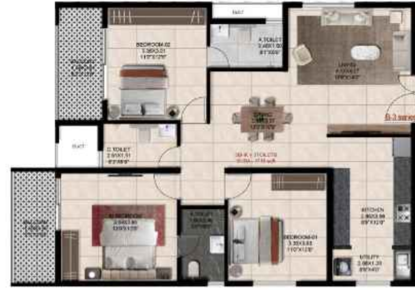
SBA: 1715 sft