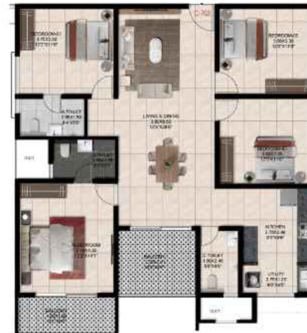
SBA: 2005 sft