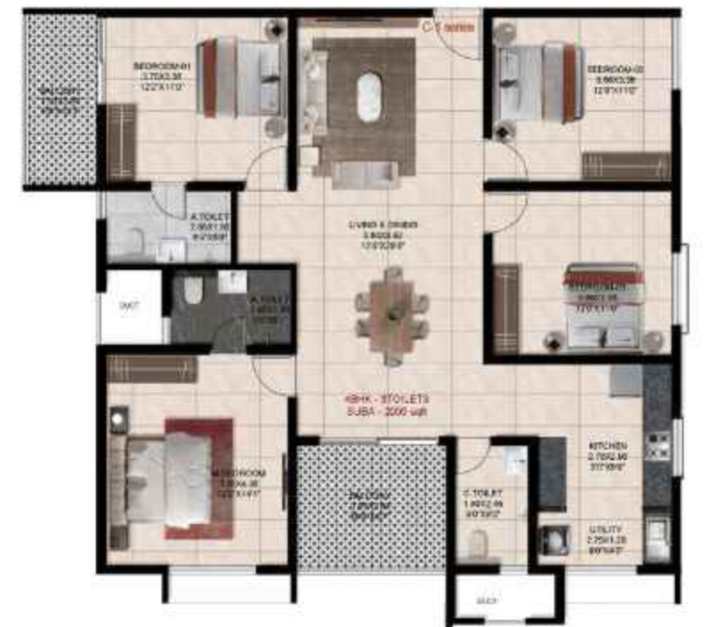
SBA: 2010 sft