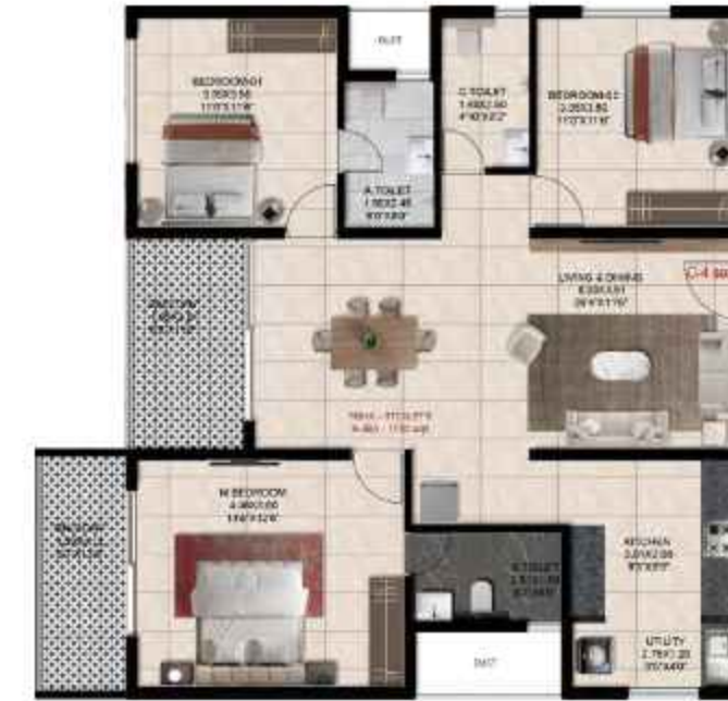
SBA: 1730 sft - 3 BHK