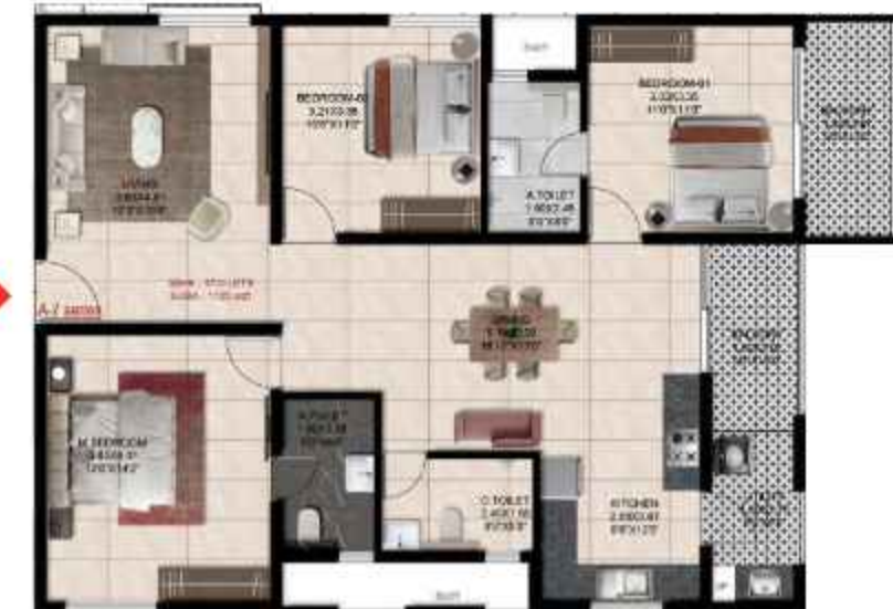
SBA: 1725 sft