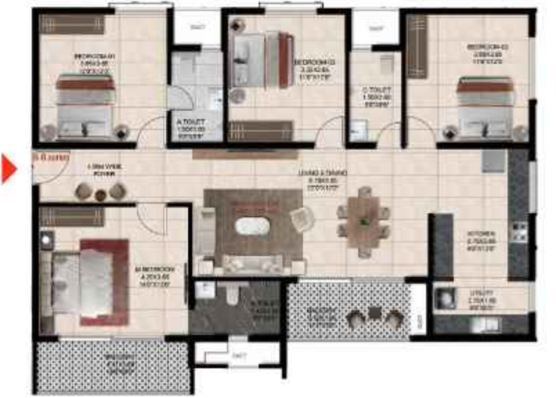
SBA: 1980 sft