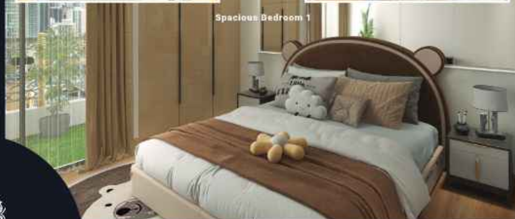
Spacious Bedroom 1