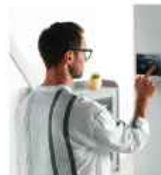
SMART HOME AUTOMATION