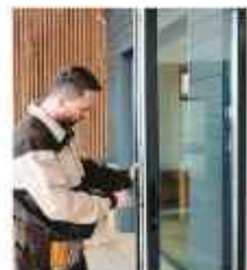
UPVC DOORS & WINDOWS