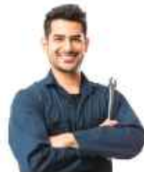
1ST YEAR FREE MAINTENANCE