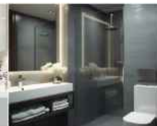
PREMIUM BATHROOM FITTINGS