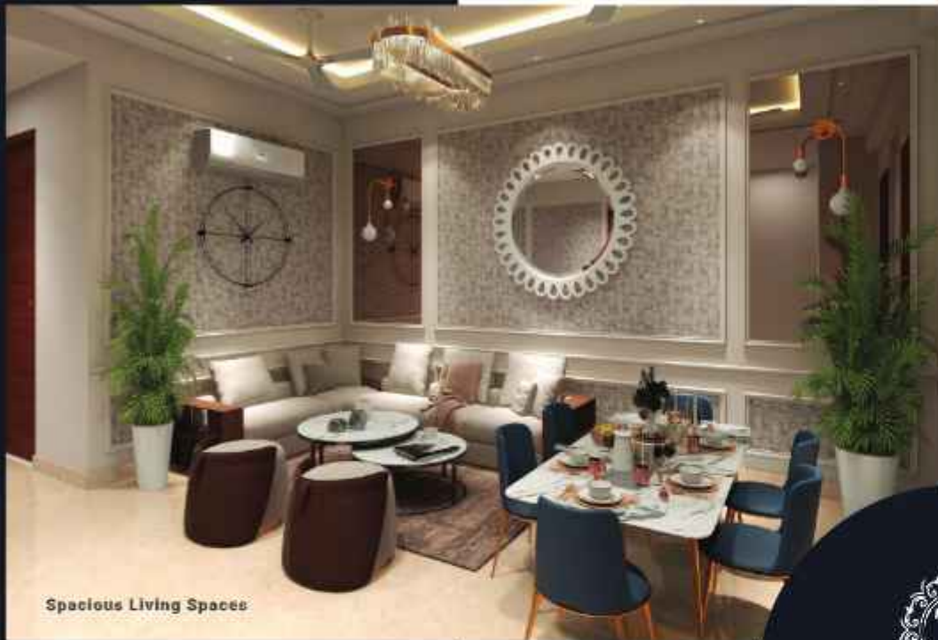
Spacious Living Spaces