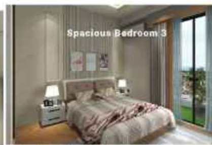
Spacious Bedroom 3