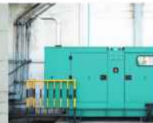
POWER BACKUP (DG)