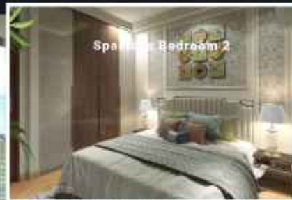
Spacious Bedroom 2